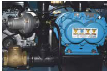
Positive Displacement Blower w/135 CFM @ 6PSI