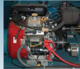
18 hp Briggs & Stratton V-Twin Gas Engine *Also available with 20hp Honda Gas Engine