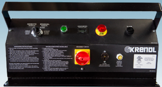
12 VDC Electric Dashboard LED start button / kill switch